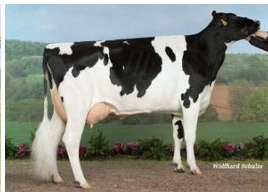
Lonar daughter MGK Loraya