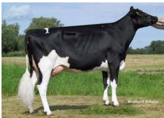
Guarini daughter Gonneke

The long-term favourite of the most used bulls is ranking On No.3., longevity specialist Lonar has been in the top list for the fourth year now, therefore proving that German breeding is focused on longevity. Lonar's cow family features excellent conformation and longevity. He sires these characteristics to his daughters as well.