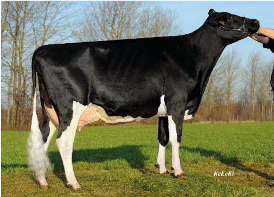
Gunnar daughter Guanita (2nd lac.)

The German Cattle Breeders Federation (ADR) published the list of the most used German bulls in 2012. Among Holstein, there is a new No.1: Gunnar. In the category Red Holsteins, Tableau is, as in 2011, on top.